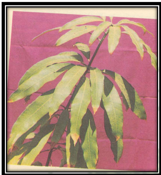
Tip burning due to chloride injury in a young seedling of mango

Injurious effects on the plants may be due to high total soluble salts or toxic conc. of ions. Ions like Na and Cl causes specific toxicity to fruit crops. The yield losses of fruits and nuts are generally greater due to specific ion toxicity rather than due to osmotic effect.