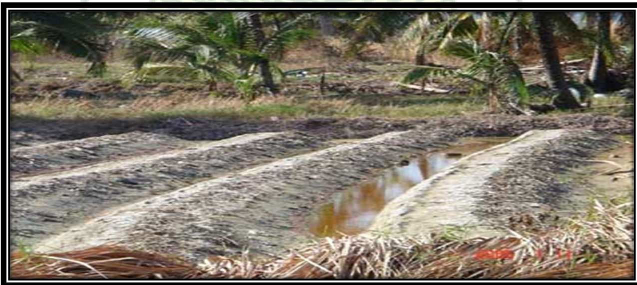
Salt damage on surface

Saline water is often high in sodium, causing sodic soil. This can potentially lead to soil dispersion and decline in permeability resulting in transient water logging within the root zone (Rengasamy and Olsson, 1991). For many crops, water logging greatly increases the uptake of toxic ions exacerbating the salinity effects. (Boland et al. , 1996; Stevens and Prior, 1994)