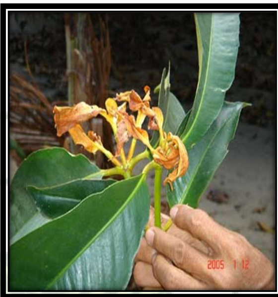
Salinity toxicity on Mangos teen